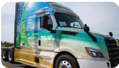
2022 Mental Health and Suicide Awareness Truck

We have committed to giving back to the communities we serve by donating a percentage of the revenue generated by our charity trucks to projects and organizations that mean the most to our employees. Operation K.A.V.I.C. (Keller Assists Veterans In Crisis), our in-house philanthropy, has raised over $400,000 to help local veterans avoid financial crisis.