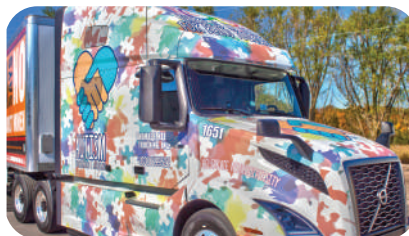
2021 Autism Acceptance and Understanding Truck