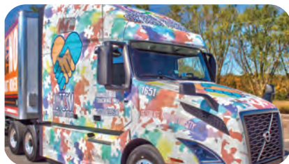
2021 Autism Acceptance and Understanding Truck