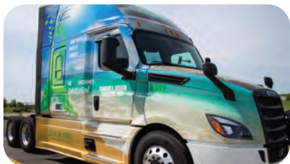
2022 Mental Health and Suicide Awareness Truck

We have committed to giving back to the communities we serve by donating a percentage of the revenue generated by our charity trucks to projects and organizations that mean the most to our employees. Operation K.A.V.I.C. (Keller Assists Veterans In Crisis), our in-house philanthropy, has raised over $400,000 to help local veterans avoid financial crisis.